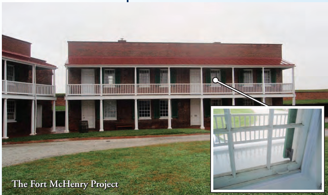
The Fort McHenry Project